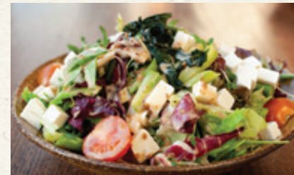
S1 Green Salad