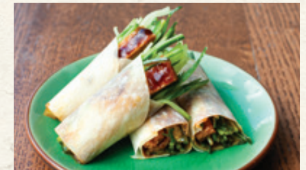
S3 Vegetarian Duck Rolls