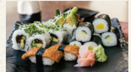
V2 Vegetarian Box 14 pcs 9.20