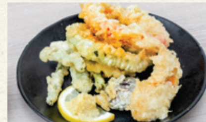
T2 Yasai Tempura