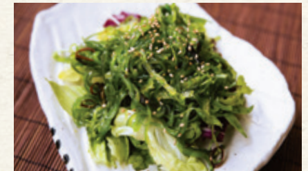
S20 Chuka Wakame