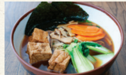
N2 Tofu and Vegetable Ramen 9.50