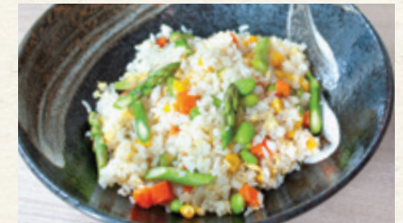
R13 Asparagus and Vegetable Fried Rice 9.50