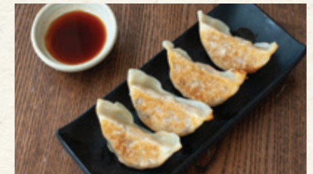
S23 Veggie Gyoza