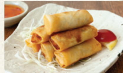
S8 Vegetarian Spring Rolls