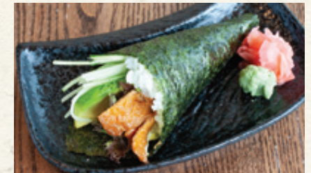
M10V Vegetarian Temaki Hand Roll 4.70