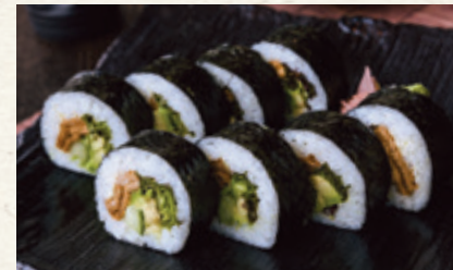
M5 Inari & Avocado Maki 8pcs 5.80