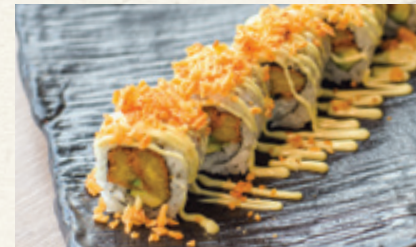
M16 Crunchy Pumpkin Maki 6pcs 7.20