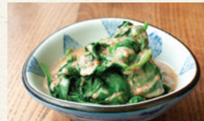
S12 Goma Horenso